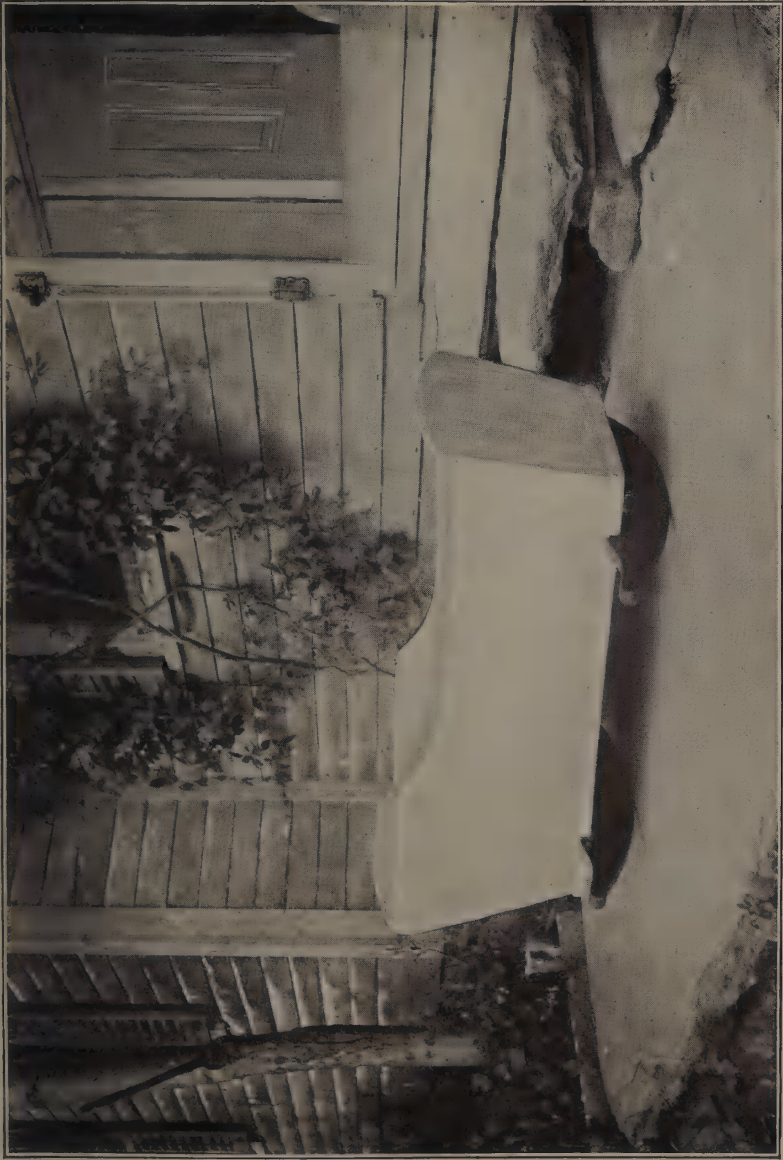
CRADLE IN WHICH JOHN BURROUGHS WAS ROCKED